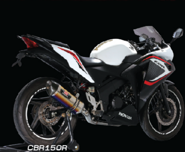
CBR150R MODEL R-778