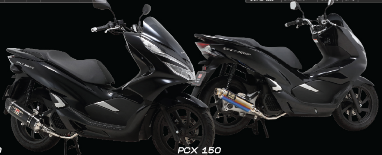
PCX 150 MODEL R-778