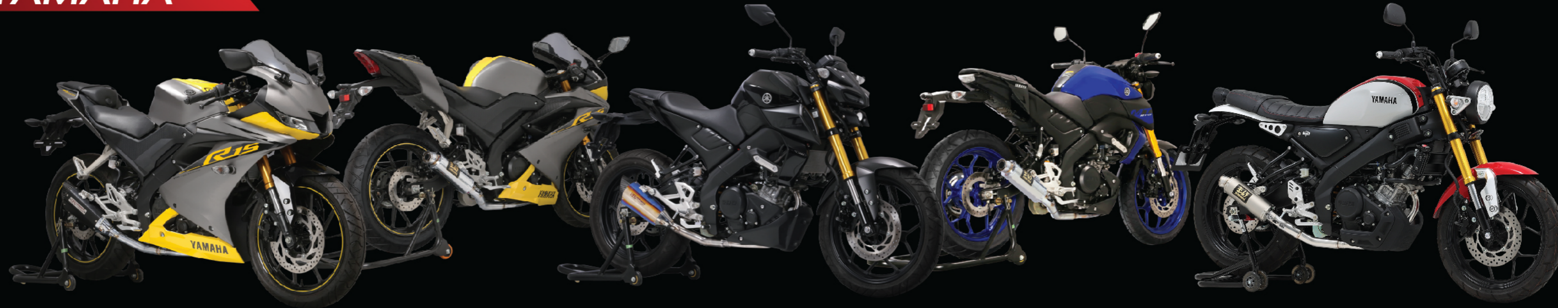
YZF-R15 / MT-15 MODEL HEPTAFORCE