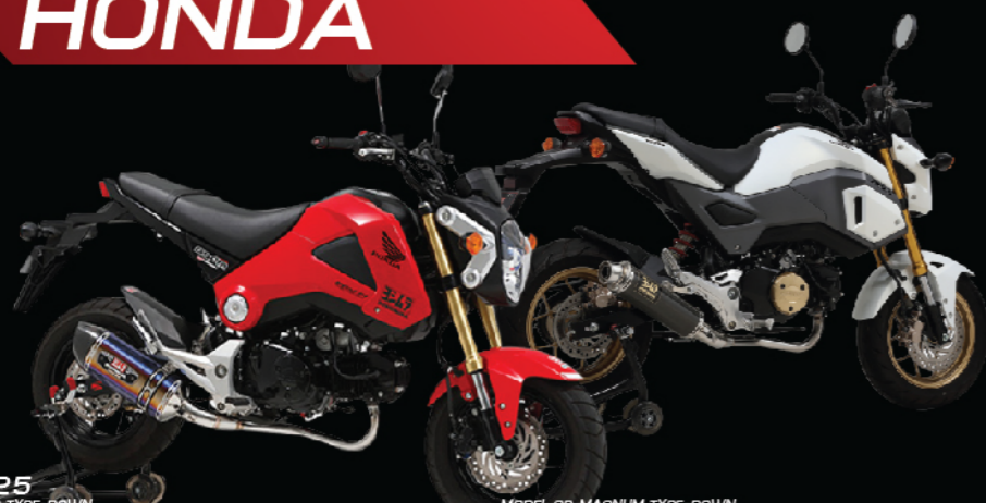
MSX125 MODEL R-778 TYPE-DOWN