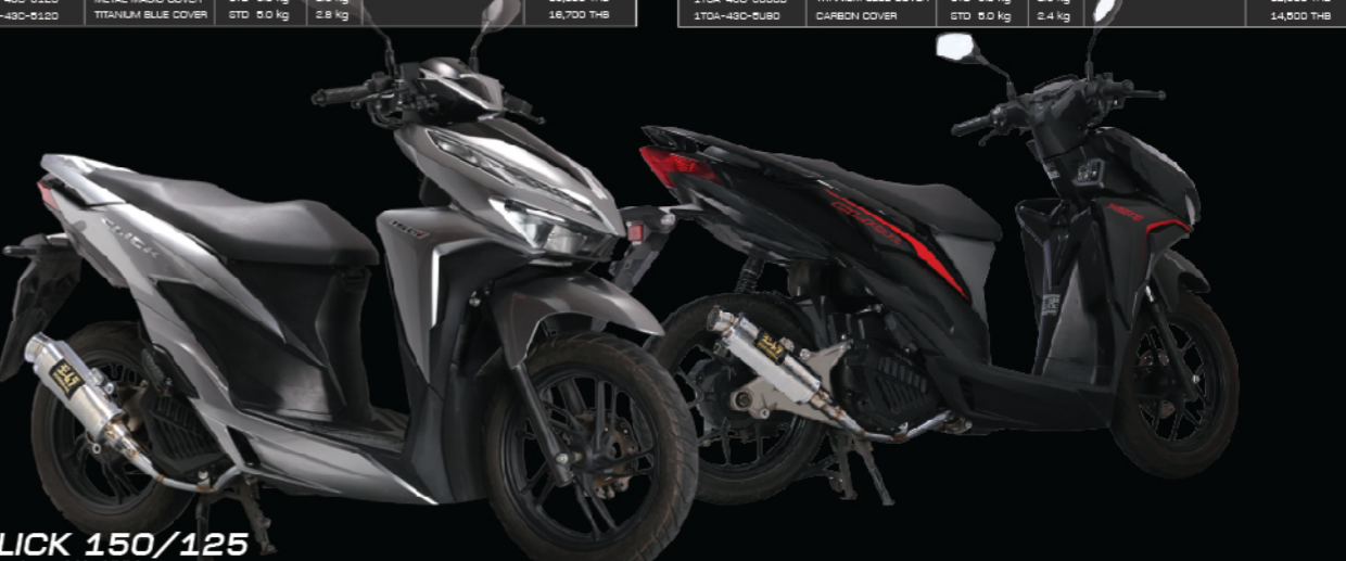
CLICK 150/125 MODEL GP-MAGNUM