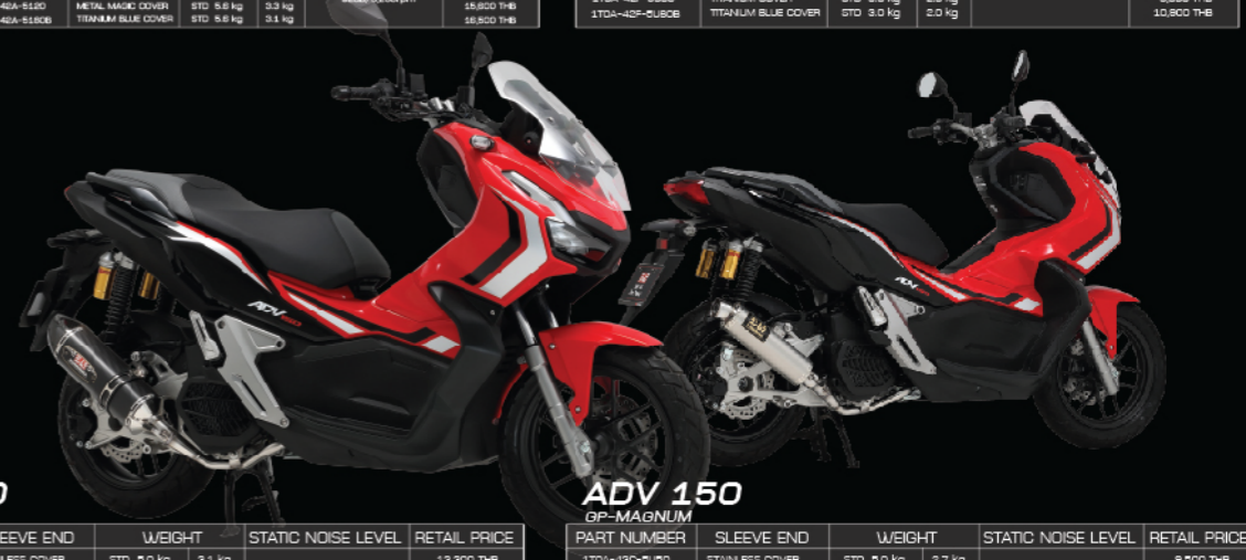
ADV 150 GP-MAGNUM