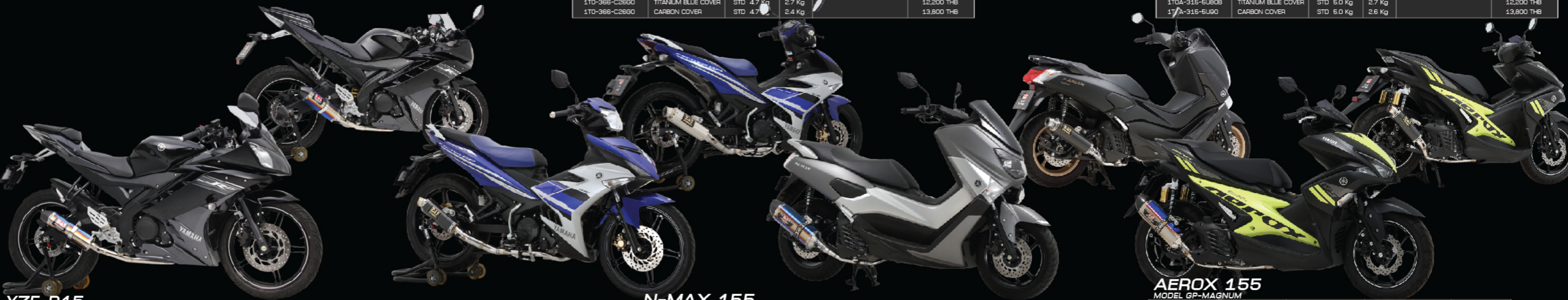
YZF-R15 MODEL TRI-CONE