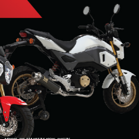
MODEL GP-MAGNUM TYPE-DOWN