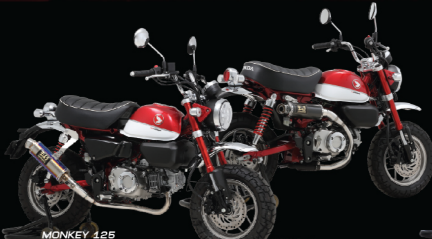
MONKEY 125 GP-MAGNUM Type-Down