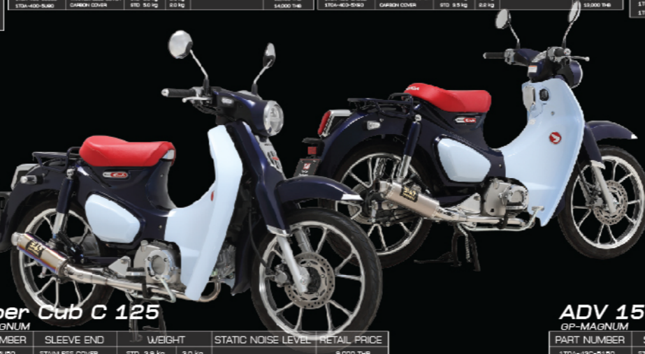
Super Cub C 125 GP-MAGNUM