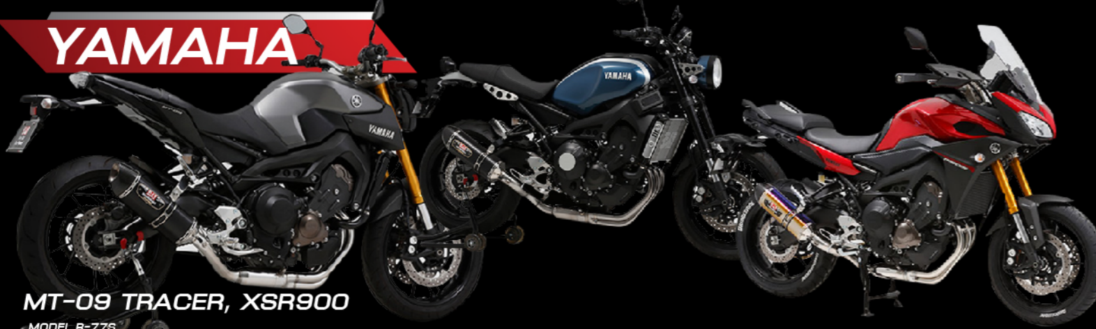
MT-09 TRACER, XSR900